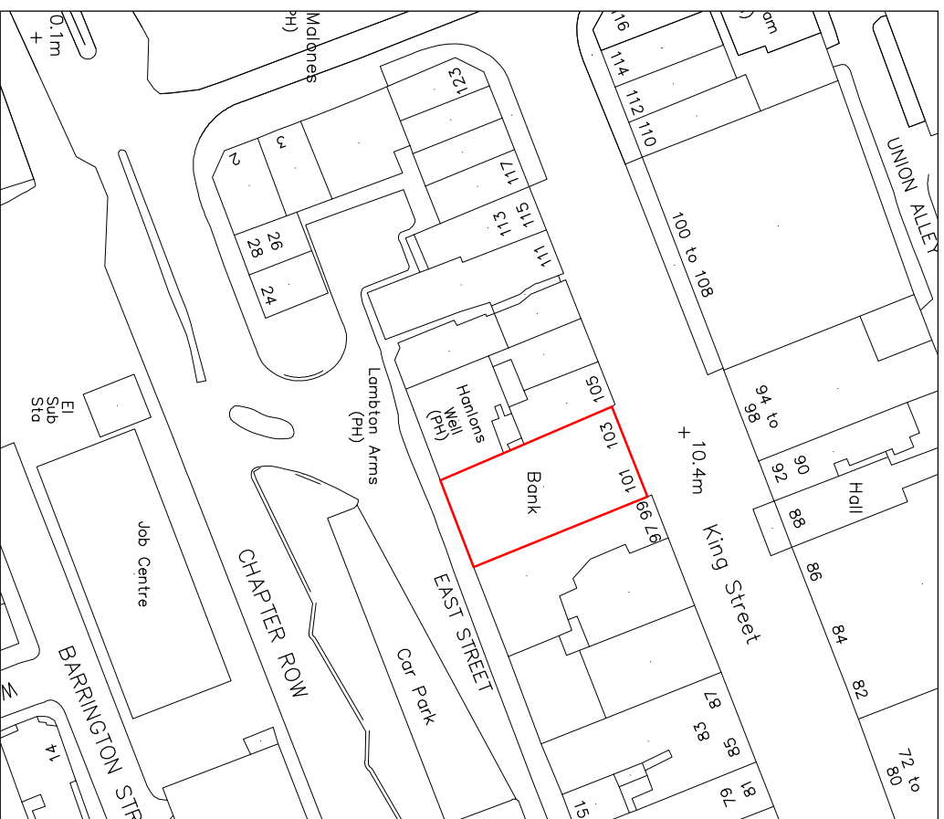
Block Plan (1:500)