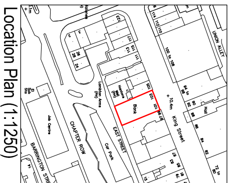
Location Plan (1:1250)